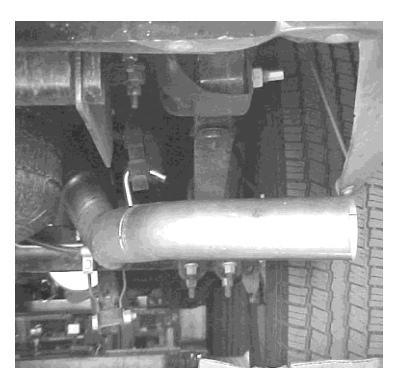
INSTALL EXIT PIPE #D ONTO OVERAXLE TAILPIPE USING CLAMP# E TO SECURE. ROTATE EXIT PIPE UNTIL IT IS AT THE CORRECT ANGLE FOR YOUR TRUCK. INSERT WELDED HANGER INTO RUBBER GROMMET.

BOLT HEADPIPE #A TO THE STOCK FLANGE RE-USING THE FACTORY NUTS & BOLTS. INSERT WELDED HANGER INTO RUBBER GROMMET. DO NOT TIGHTEN.