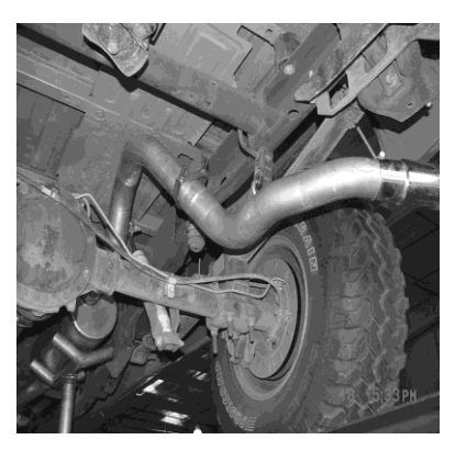
INSTALL OVERAXLE TAILPIPE #C INTO THE OUTLET OF THE MUFFLER 1 1/2" TO 2" USING CLAMP #E TO SECURE PIPE TO MUFFLER. INSERT WELDED HANGER INTO RUBBER GROMMET.

TO REMOVE STOCK EXHAUST UNBOLT THE STOCK EXHAUST AT THE FLANGE BEHIND THE Y-PIPE AND REMOVE. MAKE SURE TO LEAVE ALL RUBBER GROMMETS IN THE FACTORY LOCATION. YOU WILL RE-USE STOCK NUTS AND BOLTS. FOR EASIER REMOVAL OF EXHAUST, CUT BEHIND THE MUFFLER. USE WD-40 TO REMOVE HANGERS FROM GROMMETS.