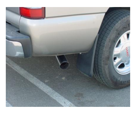
INSTALL THE STAINLESS STEEL TIP NOW, FIRMLY TIGHTEN EVERYTHING ALL CLAMP, HANGERS, BOLTS, FLANGE. TO CLEAN TIP USE ANY STAINLESS CLEANER WITH A SCOTCH BRITE PAD.

NEXT CONNECT THE MUFFLER TO THE HEADPIPE 1 1/2" TO 2" USING CLAMP #E. TO SECURE MUFFLER TO PIPE, USE JACKSTANDS TO SUPPORT THE MUFFLER. THE OUTLET OF THE MUFFLER WILL BE AT APPROXIMATELY 11 O'CLOCK. THE MUFFLER INLET IS LOOKING INTO THE LOUVERS. DO NOT TIGHTEN.